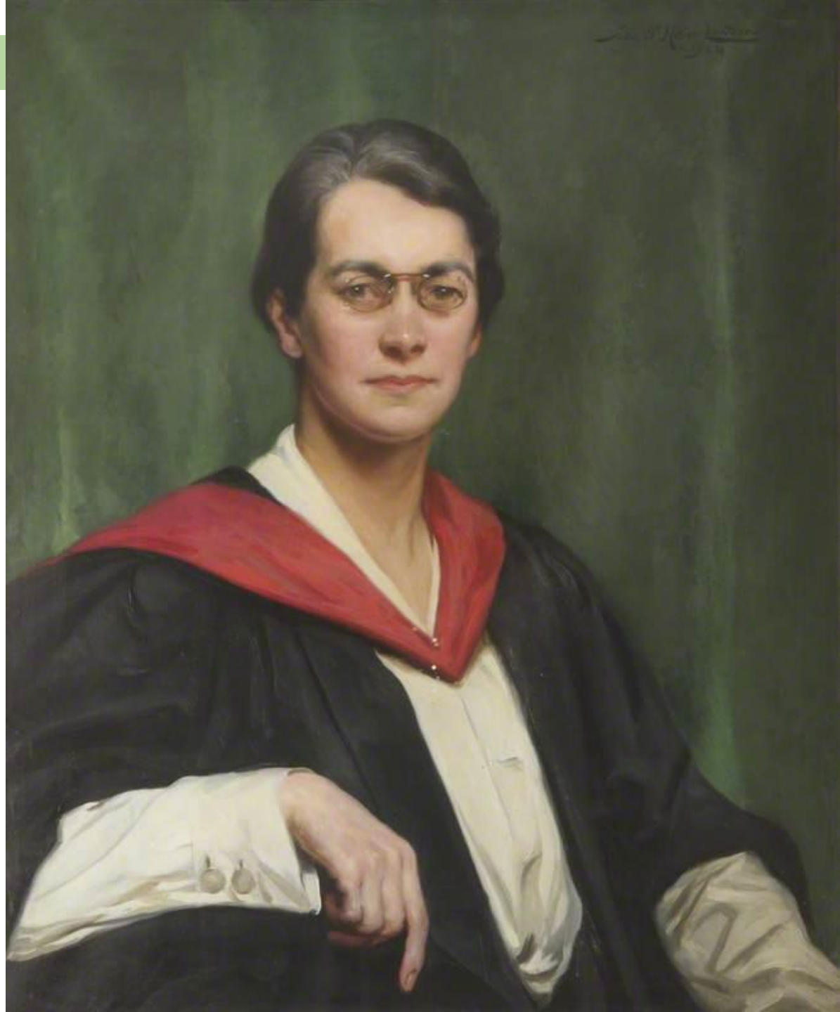
Portrait at St. Hilda's College