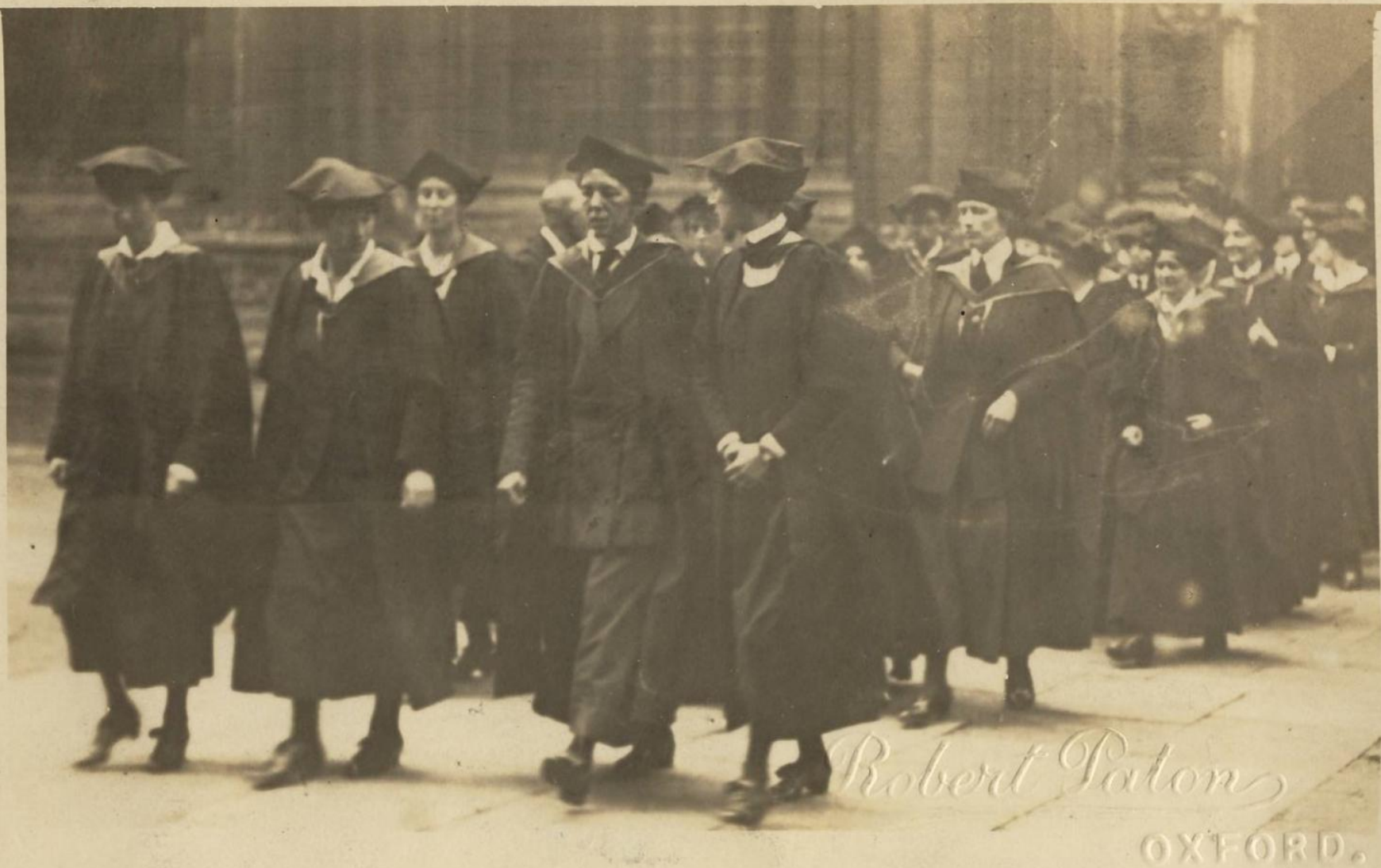
The first degrees 1920