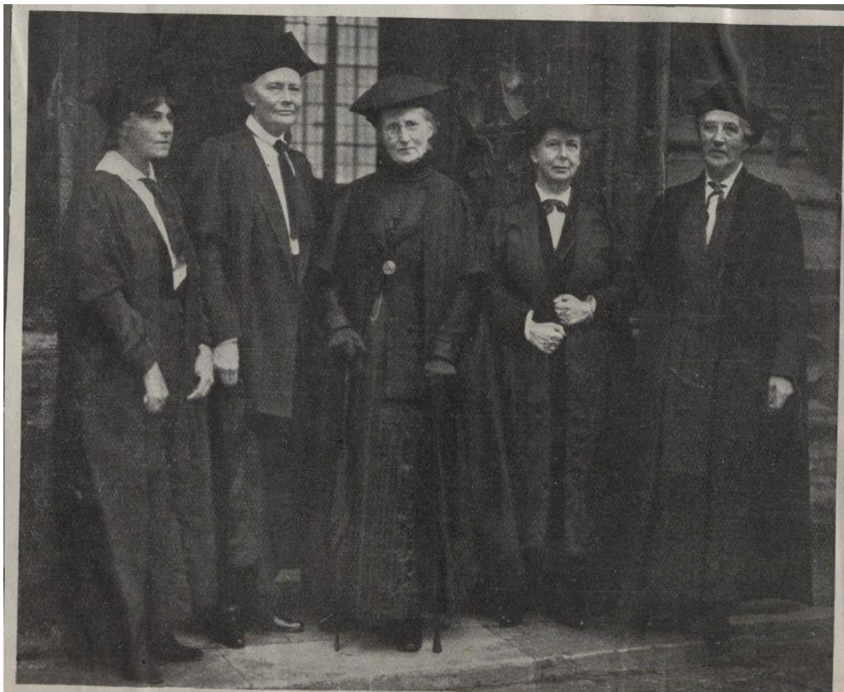
C. N. OXFORD FOR THE FIRST TIME IN ITS HISTORY OF 900 YEARS HAS JUST CONFERRED DEGREES ON WOMEN GRADUATES IN THE SHELDONIAN THEATRE OF THE UNIVERSITY.